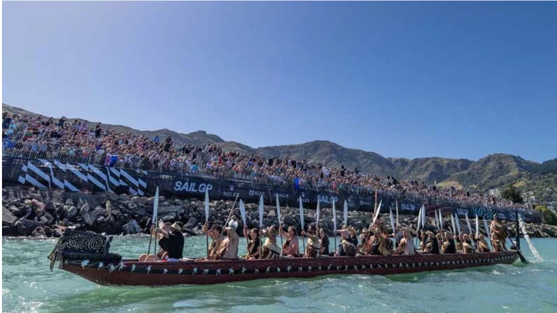
Kōtukumairangi is front and centre on the best photos from Christchurch gallery on the SailGP web page.

The Museum had a fabulous time working with Rāpaki - Te Hapū o Ngāti Wheke and the Ngāi Tahu Archive on the curation of a small exhibition of waka-related taonga for SailGP.