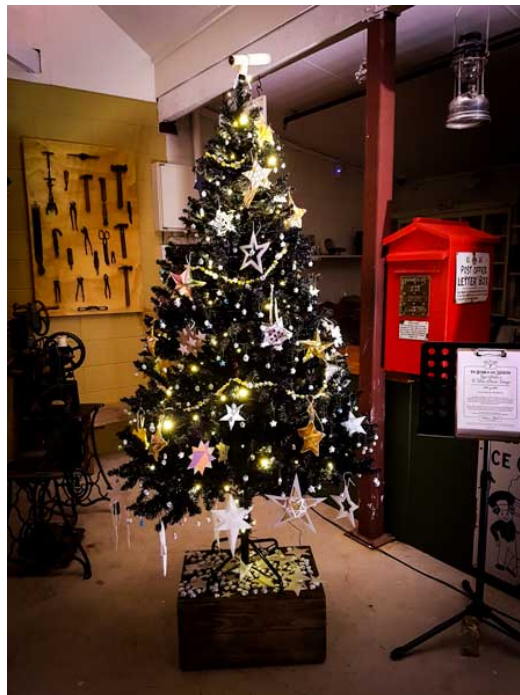
Image: 'The Stars of Canterbury Museum' tree design from our recent Christmas at the Museum Exhibition.

Experience first-hand some of the museum's collection of heritage equipment put to work as they were in the past.