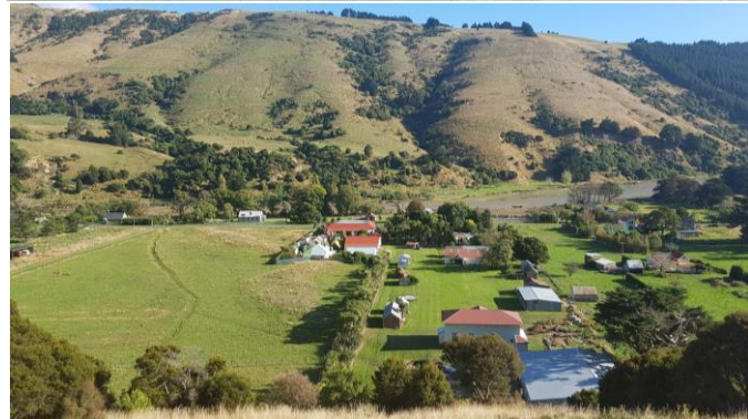
An unusual birdseye view of the museum from Peter Moore's hill.