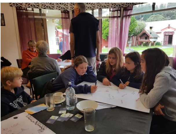
Local adults, and children from Okains Bay School contributing their ideas for the intended community hub.