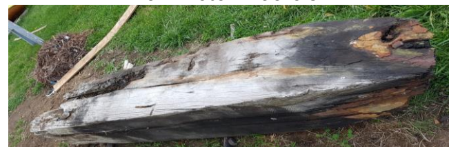
A piece of Australian hardwood from the original 1870s Okains Bay wharf, found at the beach near the Pier Hotel site.

Rick Flatman is restoring the Kahukaka and Kotukumairangi waka in collaboration with Ngai Tahu. A section with marks showing where the timbers are dove-jointed. The existing seats will be replaced with lower seats for the ease of paddlers on ocean going waka.