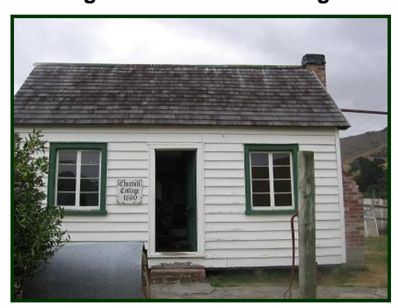
Figure 7 Churchill Cottage

Maheno Honotapu of the Taiapa family took responsibility for and produced most of the beautiful tukutuku panel work of the interior.