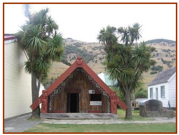
Figure 6 Whakaata

One of the highlights of the Museum is the meeting house which was built on site with complete adherence to tikanga Maori. The rafters came from an old meeting house in Tokomaru Bay, a generous gift from the Potae family and in keeping with the tradition that each new house should have something in it from an old one.