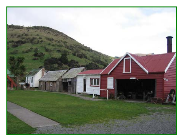
Some of the colonial buildings each housing its own collection

Perhaps though the most valuable aspect of the Museum is the close juxtaposition of the Maori and Colonial aspects of the Museum collections. The natural and tangible way in which the collections are displayed facilitates comparative and parallel learning about the