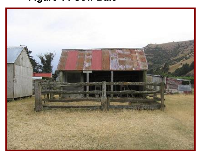
Figure 14 Cow Bale

The historic cow bale often holds a cow with calf on Waitangi day to the delight of city visitors and children.