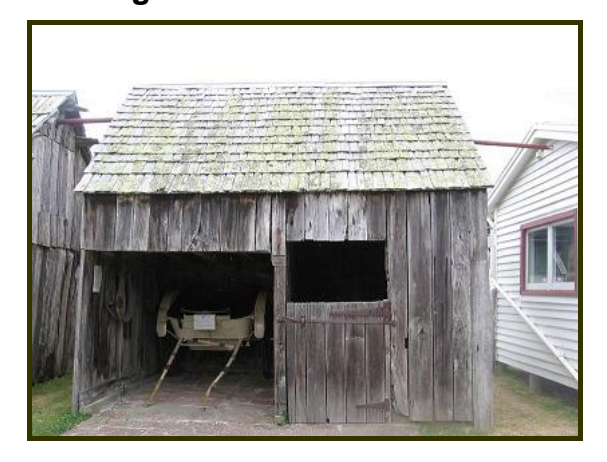
Figure 9 Slab Stables

The Slab Stables were built from pit-sawn totara in 1871, by Johnnie Moore of Okains Bay. They were in continuous use until donated to the Museum by George Moore. The Stables houses a Governess cart.