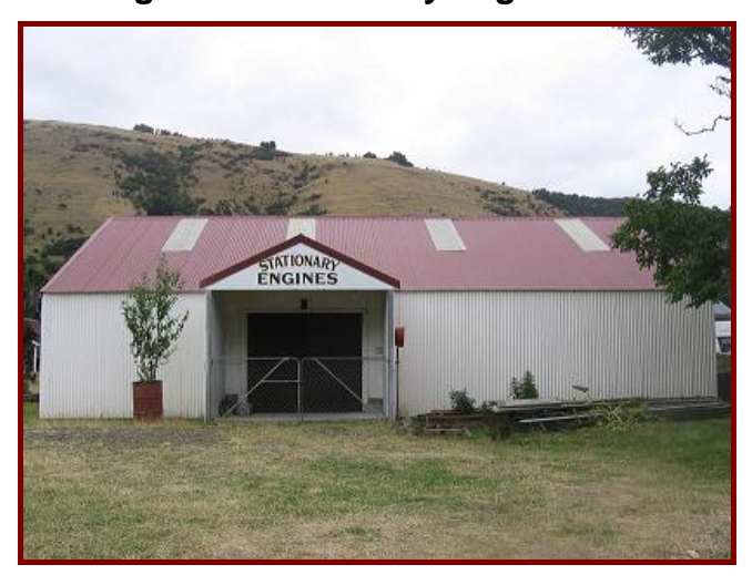
Figure 13 Stationery engines

Adjacent to the central area of the Museum is a large grassy paddock, very rural in nature and often grazed by sheep known as the Arena. The buildings surrounding the Arena are generally of a more agricultural or industrial nature. On Waitangi day the area is used for working displays of vintage equipment, stalls and the very popular children's races.