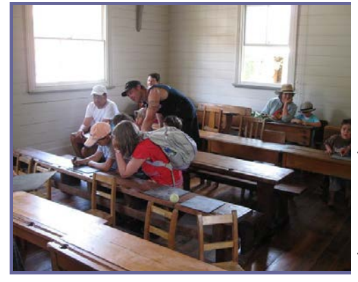
Doing sums on slates in the Old School – and poking a real fire in the Smithy are a novel experiences for children.