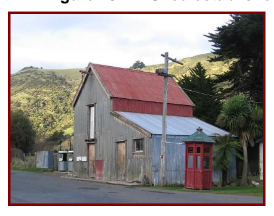
Figure 28 Tin Shed established 1880s

The Tin Shed was originally used for finishing and sale of Cocksfoot seed. It is currently a working petrol station run by the shop and offers a venue for local artists to display and sell art and craft work.