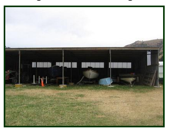
Figure 16 Bullock Wagon and Boatshed

As well as its waka, the Museum holds an extensive collection of European boats. Approximately 50 boats and related items are held in this shed, along with some bullock wagons.