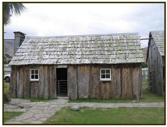
Figure 8 Slab Cottage