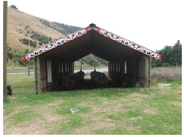
Figure 26 Riverside Waka shed