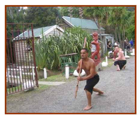
Commemorations commence with a powhiri followed by speeches.