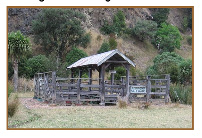
Figure 19 Addington Sale Yard

When the Addington sale yards in Christchurch were re-developed on a new site a few years ago, the Okains Bay Museum again came to the rescue of original colonial structures which were relocated to form an important part in the interpretation of the colonial farming and rural story.