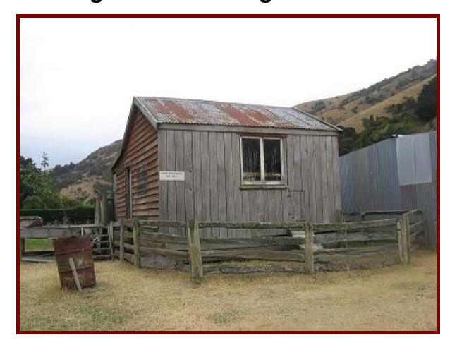
Figure 15 Shearing Shed

The old Shearing Shed is also in operation on Waitangi Day, giving visitors a real taste of what is still an important industry on Banks Peninsula.