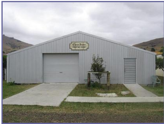
Figure 24 Print Shop