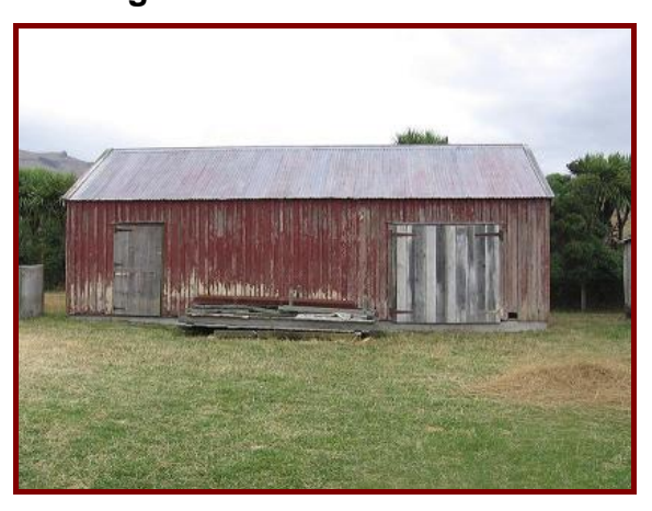
Figure 20 Cockfooters shed

This shed houses cocksfoot machinery and equipment which is used for live demonstrations on Waitangi Day. The growing and harvesting of Cocksfoot grass seed was a principal industry of Banks Peninsula in the late 19<sup>th</sup> century and the area of its highest production as the landscape transformed from one of forest to one of pasture. There are many stories and recollections of the cocksfoot industry to be told that are unique to Banks Peninsula and these are being collected as part of the Museum's Oral history recordings.