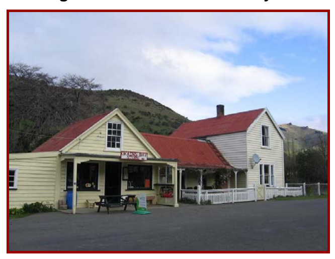
Figure 27 Historic Okains Bay Store established 1873

Murray Thacker gifted the Okains Bay store to the Museum in 2009. It is believed to be the oldest continuously operated shop in New Zealand and provides a vital service to the local community as well as the many holiday makers who stay at the Okains Bay Campground over the summer. The Museum currently lets the store and the adjoining house to tenants who run the business.