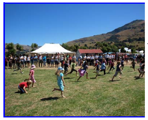
Childrens races at the Arena followed by the traditional tug of war with all ages participating!