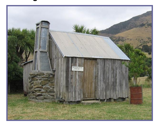
Figure 21 Cocksfooters Hut

Along with the cocksfooting equipment, the original Cocksfooter's hut, the only one left on Banks Peninsula, provides a testatment to a unique period in Banks Peninsula history and gives the Museum an opportunity to interpret a way of life and a whole industry once so important and now completely disappeared.