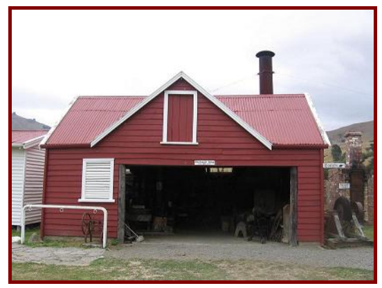
Figure 11 Blacksmiths