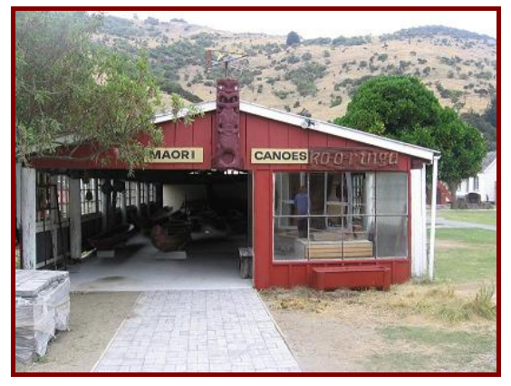
Figure 3 Maori Canoes