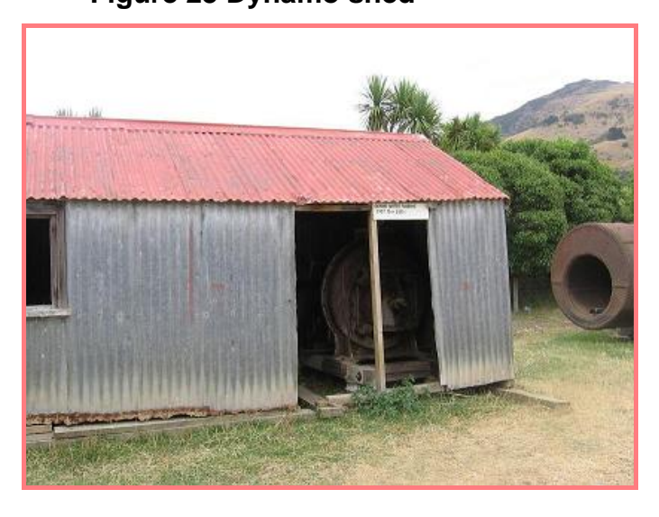
Figure 23 Dynamo shed

The Dynamo shed houses the Museum's collection of pelton wheels and power generating equipment, again representing significant improvements to the standard and ease of living since the early Colonial times. The Dynamo shed was installed in 1904, to house the 12 horsepower (230 volts) water turbine and powered four houses until power from the Coleridge station came to the Bay 1923.