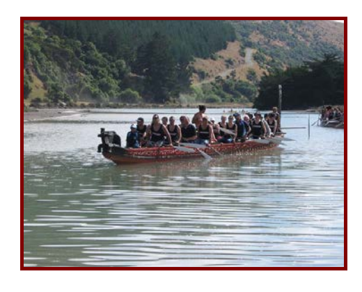
The majestic waka makes its way from the river mouth to the Museum jetty and then the hangi is lifted