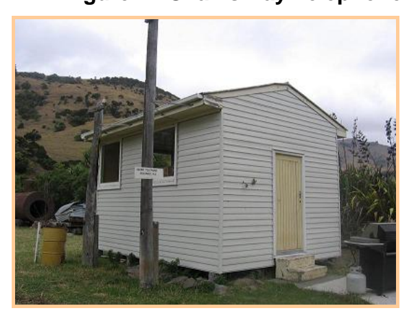
Figure 22 Okains Bay Telephone Exchange

It is hard now, with modern roading and communications to appreciate the isolation of a place like Okains Bay, once reliant entirely on ships calling into Bay small the communications with the outside world. The coming of the telephone to places like Okains Bay represents a huge change in the lives of its residents, and the Museum has acquired the old Telephone exchange to tell this story. Currently it houses a collection of telephone and movie projection equipment.