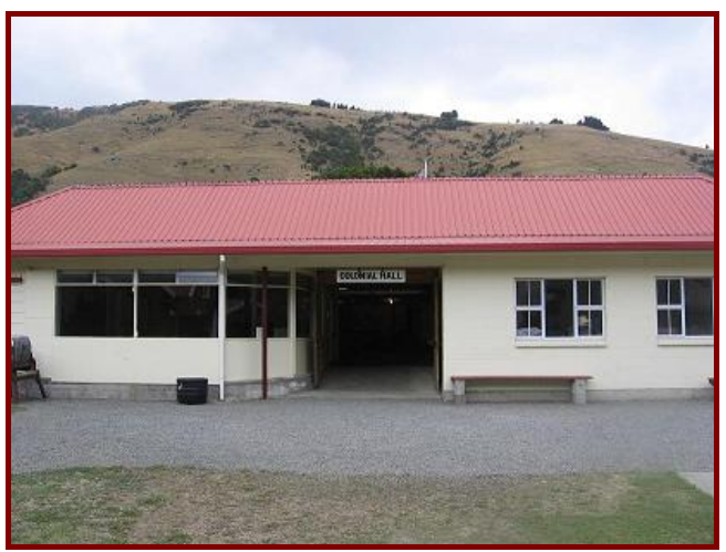
Figure 12 Colonial Hall

On leaving school, Murray Thacker trained as a blacksmith, and the Smithy building is fully functional, and always operates on Waitangi Day. It houses an extensive collection of blacksmithing tools, many donated by local concerns, and the building itself is a converted coaching stables from Duvauchelle.