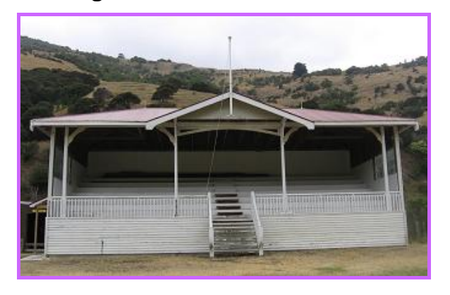
Figure 18 Recreation Pavilion

The grandstand originally stood on the Recreation Ground in Akaroa itself, but was disposed of in the early 1990s and thought to be beyond repair. A major achievement of the Museum was the relocation of the building and its complete restoration. The area below the stand has been enclosed to provide accommodation and facilities for visiting groups such as school parties.