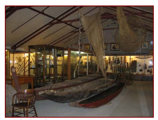
Inside the Whare Taonga

That the Maori collection at Okains Bay is of national significance is beyond question. The collection includes Whare the Taonga displaying a vast store of tiki, fishing equipment, tools, weapons, cloaks etc, much of which has been provenanced from the local area. The Museum complex includes Pataka, Matuku Rangi the wharenui, Whakaata. Several items from the collection are currently on loan to Te Papa.