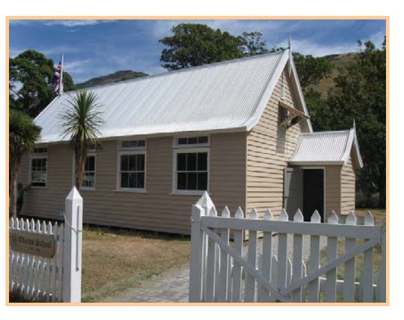
The restored building, with garage doors gone and a porch once again