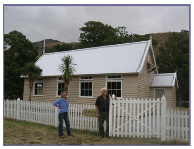
Figure 25 Old School

The Museum also owns and uses several buildings in the adjoining village precinct.