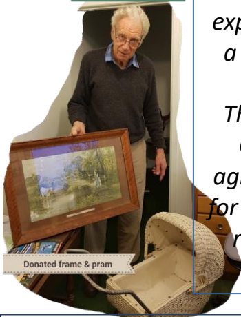
Donated frame & pram